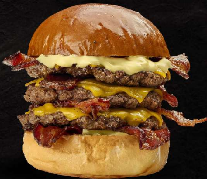
培根终结者汉堡 128 RMB BACONATOR

香炸鸡肉, 生菜, 启波特雷牧场酱 和牛奶面包 fried chicken, lettuce, chipotle ranch on a fresh milk bun