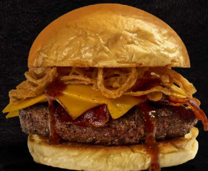
BBQ牛肉芝士汉堡 88 RMB BBQ CHEESEBURGER

烟熏牛胸铺芝士、烧烤酱, 凉拌卷心菜, 配自制汉堡面包 CAGES slow smoked brisket covered in cheese, bbq sauce, and cole slaw on our hybrid brioche milk bun