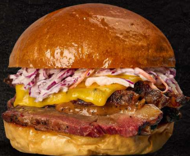
烟熏牛胸三明治 98 RMB SMOKED BRISKET SANDWICH

DON'T FORGET TO CHECK OUT OUR BURGER OF THE MONTH AVAILABLE FOR A LIMITED TIME!