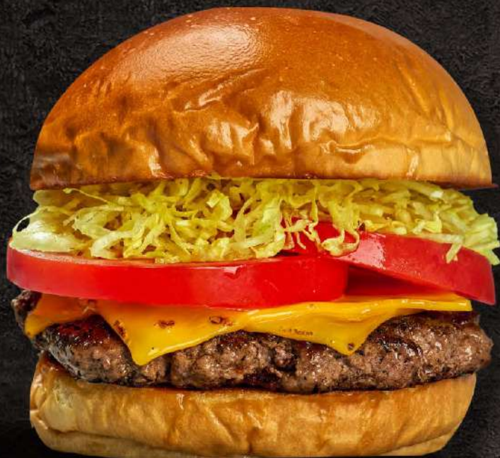
经典美式芝士汉堡 78 RMB CLASSIC AMERICAN CHEESEBURGER

ALL BURGERS AND SANDWICHES ARE SERVED WITH YOUR CHOICE OF FRIES OR GARDEN SALAD