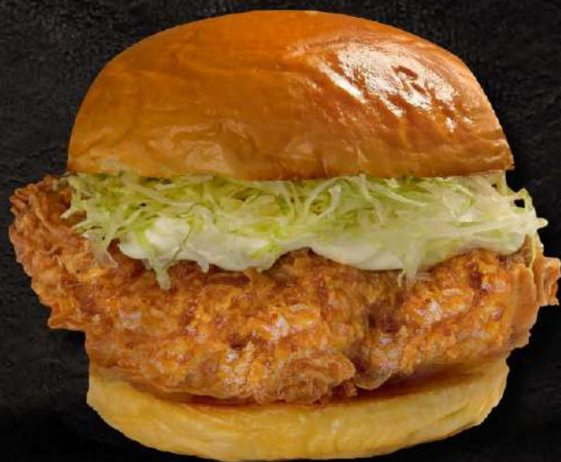
炸鸡三明治 68 RMB FRIED CHICKEN SANDWICH

200克牛肉饼, 烧烤酱, 炸洋葱, 培根, 芝士 200g beef patty, BBQ sauce, fried onions, bacon, cheese